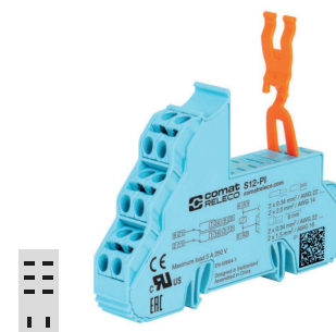
fig. 1. Wiring diagram