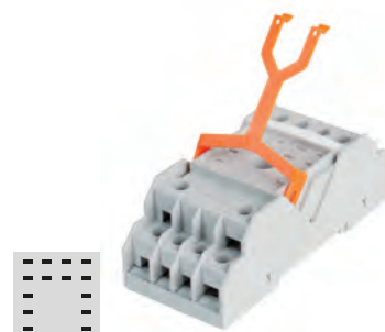
fig. 1. Wiring diagram